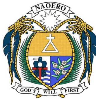
19. Science and Technology