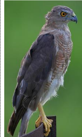
8. Science and Technology