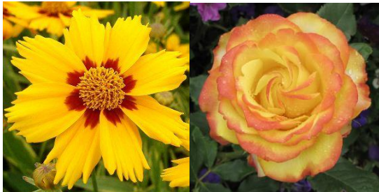
1. Food and Drink