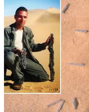
20. Science and Technology