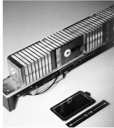
7. Science and Technology