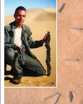
20. Science and Technology